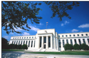
The Federal Reserve Building Washington, DC