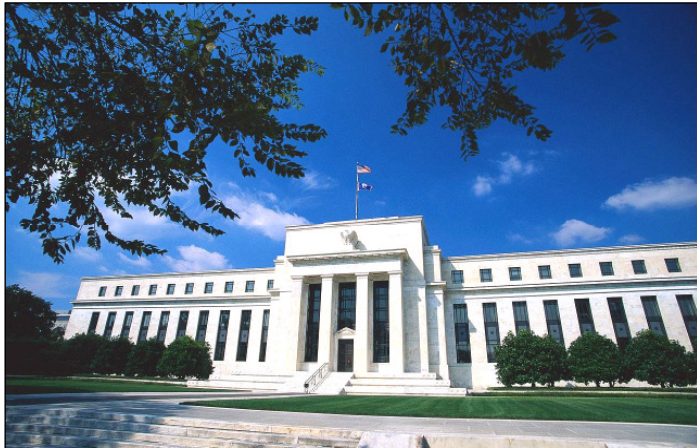
The Federal Reserve Building Washington, DC